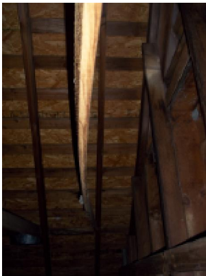
Bowing brace in attic.

Examples of the cracks which have occurred after the foundation work was done.