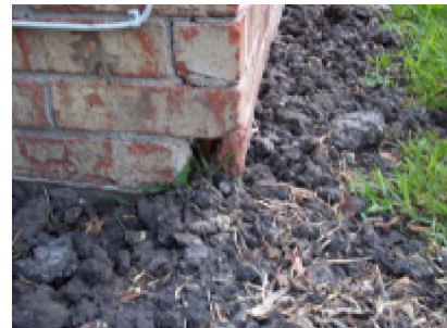
High grading, broken corner brick.